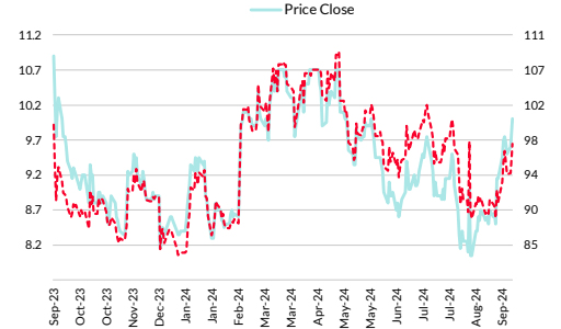
Sino Thai Engineering & Construction Plc (STEC TB)